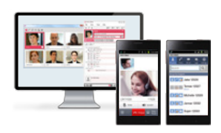
iPECS UCS Client (PC & Mobile)